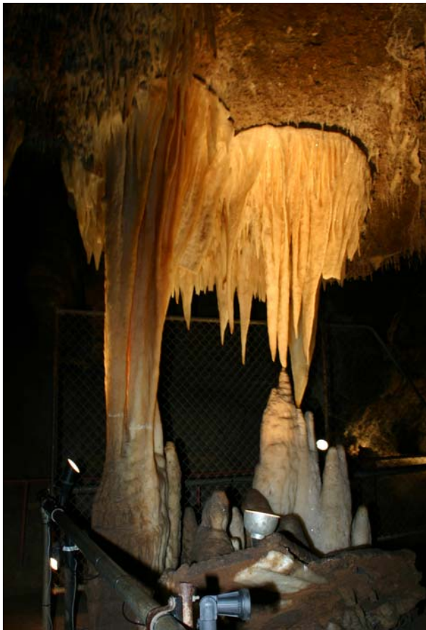
'The Ivory Palace', Fairy Cave, Buchan