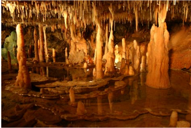
'Font of the Gods', Royal Cave, Buchan